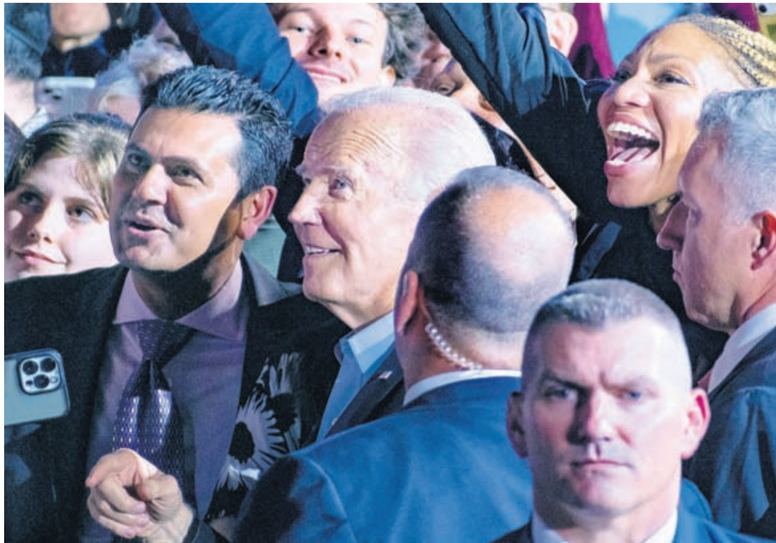
President Joe Biden poses for photos at the end of a campaign event with New York Gov. Kathy Hochul at Sarah Lawrence College in Yonkers, N.Y., Sunday, Nov. 6, 2022.

Campaigning in New York for Gov. Kathy Hochul on Sunday, Biden said Republicans were willing to condone last year's mob attack at the Capitol and that, after the recent as-